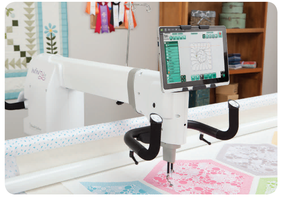
HQ Pro-Stitcher shown on the HQ Infinity 26.