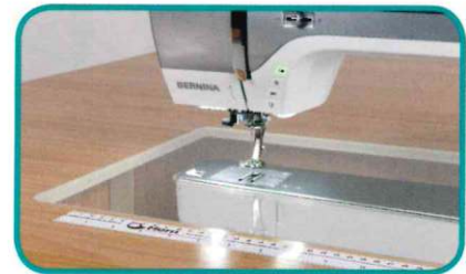
New flat bed Cut-out design

Even larger work surface for your sewing and quilting needs